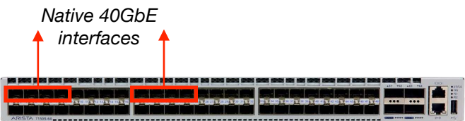
Arista 7150S AgilePorts - Four SFP+ grouped to deliver 40GbE