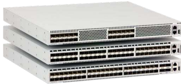
Arista 7150S family

Designed to suit the requirements of demanding environments such as ultra low latency financial ECNs, HPC clusters and cloud data centers, the class-leading deterministic latency from 350ns is coupled with a set of advanced tools for monitoring and controlling mission critical environments.