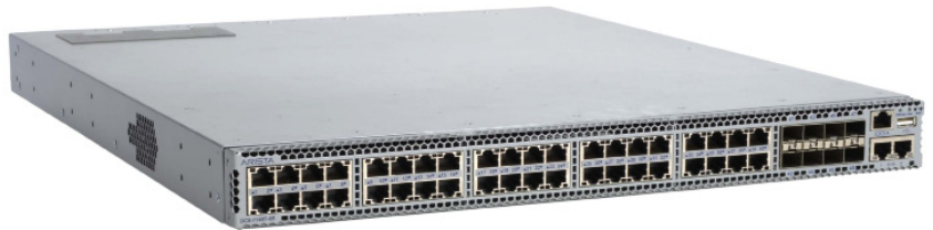
Arista 7140T-8S: 40-port 1/10GBASE-T (RJ-45) + 8 SFP+, 800 Gbps, 600 Mpps, L2/3/4

The Arista 7100T switches support 10GBASE-T over Category 6a and 7 cabling up to 100m, but also support Category 5e* and Category 6 cabling with distances up to 55m. This allows for investment protection with existing cabling plants.