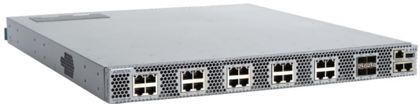
Arista 7120T-4S: 20-port 1/10GBASE-T (RJ-45) + 4 SFP+, 480 Gbps, 360 Mpps, L2/3/4