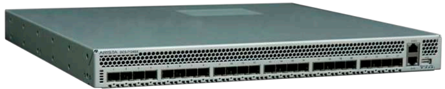
Arista 7124SX: 24-port 10GbE 480Gbps switch

The Arista 7124SX switch is a high performance, ultra-low latency layer 2/3/4 10 Gigabit Ethernet switch. Offered with 24 1/10GbE ports in a compact and power efficient 1RU chassis, the Arista 7124SX forwards packets in less than 500 nanoseconds. All ports accommodate the full range of 10GbE SFP+ and GbE SFP options, allowing for maximum flexibility and investment protection as customers of all sizes migrate their server connections from Gigabit to 10 Gigabit Ethernet. With Arista EOS, advanced monitoring and provisioning capabilities such as Latency Analyzer, Zero Touch Provisioning, VM Tracer and Linux based tools can be run natively on the switch. A built in SSD is available for advanced logging, data captures and various services that can now be run from the switch.