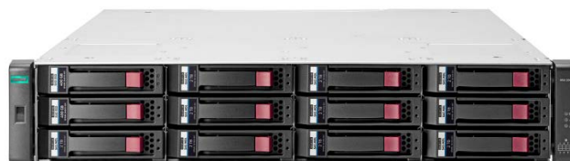
HPE MSA 2042 Storage (LFF)

The MSA 2042 further drives the MSA 2040 family into the world of flash acceleration with a new set of MSA models which includes 800GB of flash capacity in all SFF and LFF configurations. In addition to including 2x400GB Mixed Use SSDs in the base configuration, the MSA 2042 also includes a rich set of software features as standard including 512 Snapshots, Remote Replication and Performance Tiering capabilities, all at a very attractive price compared to other hybrid configurations. The 800GB of SSD capacity can be used as Read Cache or as a start to building a fully tiered configuration. With the inclusion of the Advanced Data Services SW License, customers can choose how to best utilize these SSDs to provide the optimal flash acceleration for their performance hungry applications. Both Read Cache and Performance Tiering utilize a real-time tiering algorithm which works without user intervention to place the most accessed data on the fastest medium at the right time. The MSA 2042 will dynamically move hot pages up to SSD for flash acceleration and move cooler, more stagnant data back down to spinning media as workloads change in real time hour-to-hour, day-to-day, and week-to-week. All done hands free and without any management overhead from the IT manager.