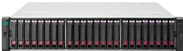
HPE MSA 2042 Storage (SFF)